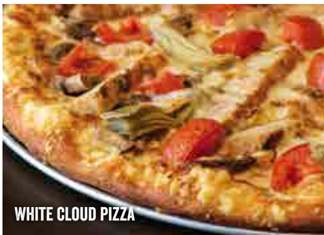
WHITE CLOUD PIZZA

A side salad and a small order of garlic bread.