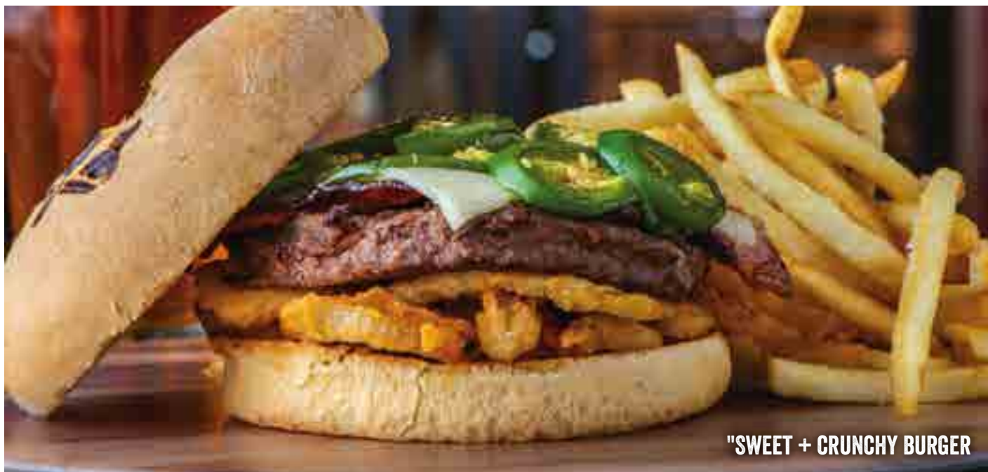
"SWEET + CRUNCHY BURGER"

Fresh jalapeños and applewood smoked bacon, candied on the grill, with swiss cheese and crispy onion straws. 16.99