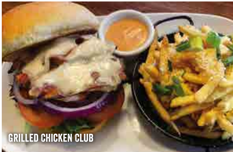
GRILLED CHICKEN CLUB

ALL SANDWICHES are served with SHOESTRING FRIES . Upgrade to GARLIC PARMESAN FRIES or SIDE SALAD for 2.49