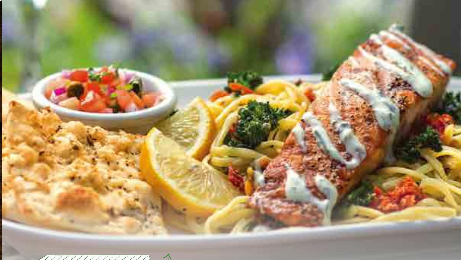
GRILLED SALMON PASTA