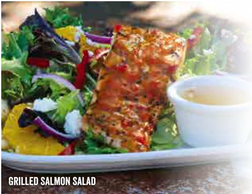
GRILLED SALMON SALAD