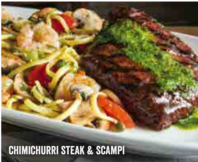
CHIMICHURRI STEAK & SCAMPI