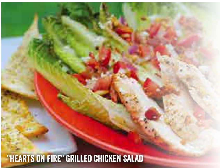
"HEARTS ON FIRE" GRILLED CHICKEN SALAD