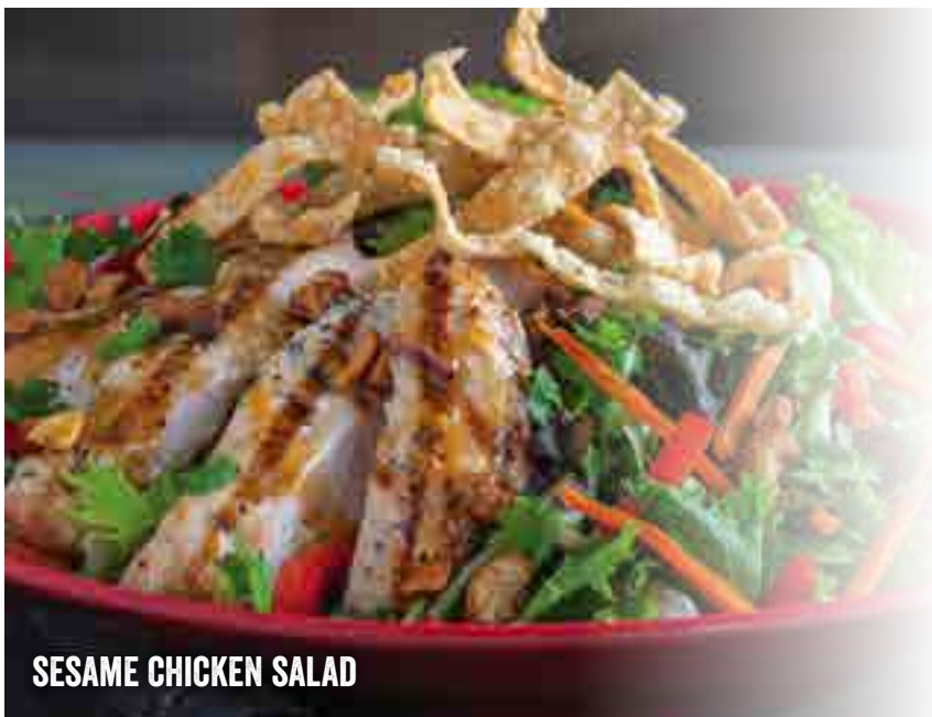
SESAME CHICKEN SALAD