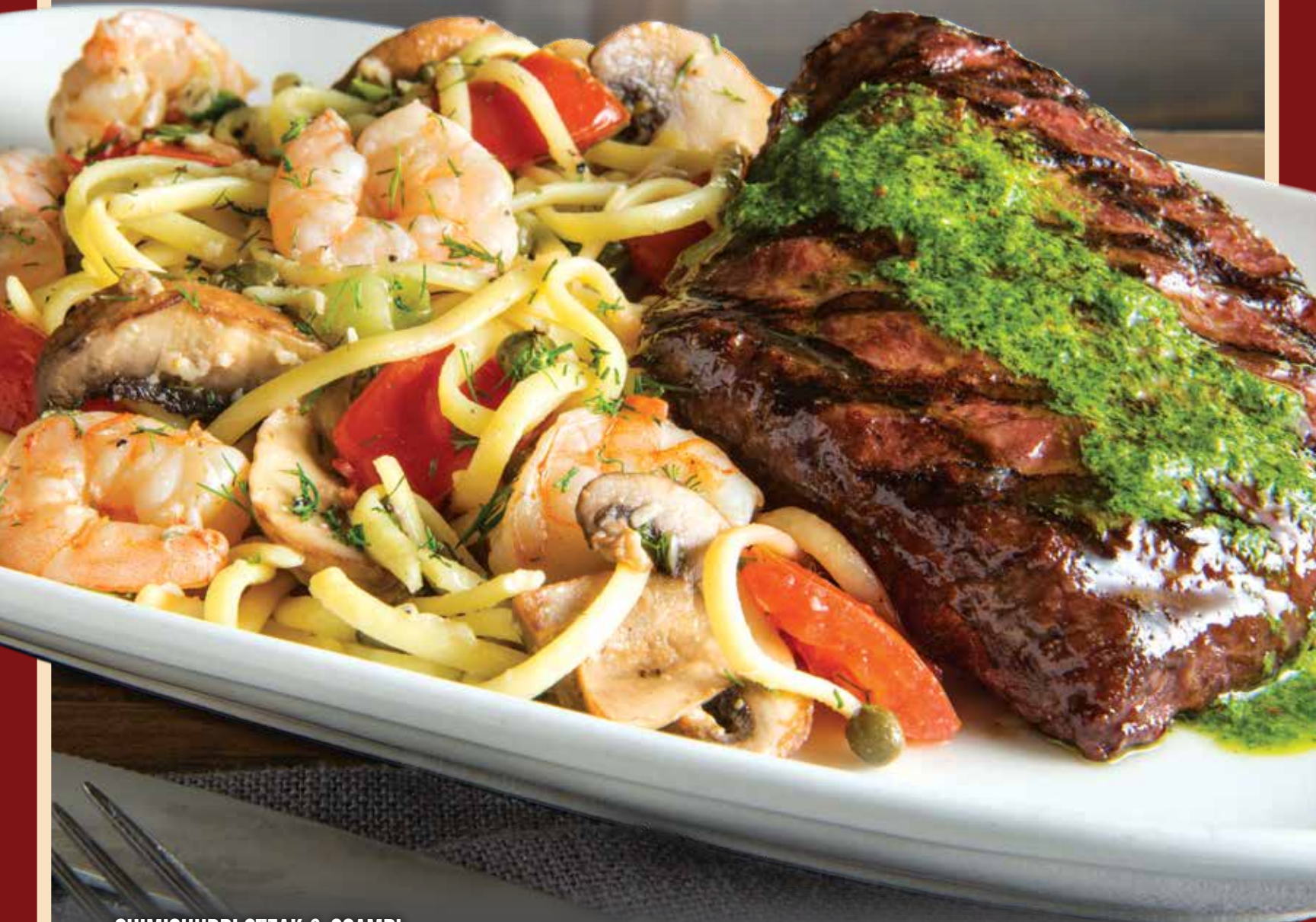
CHIMICHURRI STEAK & SCAMPI