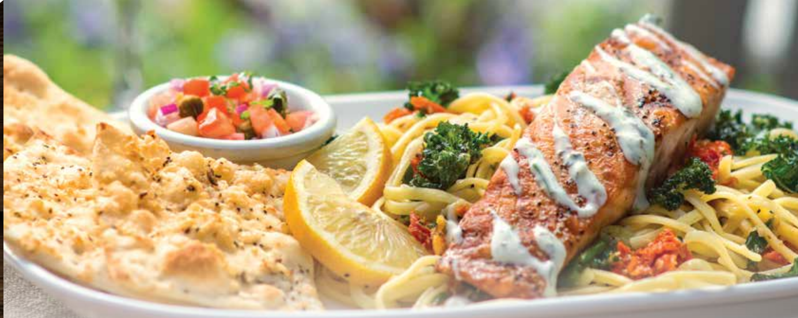
GRILLED SALMON PASTA