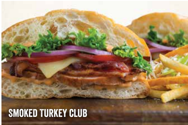
SMOKED TURKEY CLUB

Crispy Chicken Sandwiches feature TENDER CHICKEN BREAST fried to golden brown served with mayo on our TAVERN BUN .