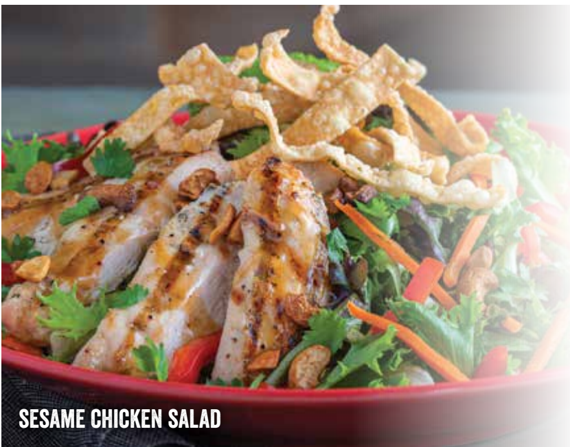
SESAME CHICKEN SALAD

Classic Caesar salad served with seasoned grilled chicken breast and herbed flatbread. 13.99