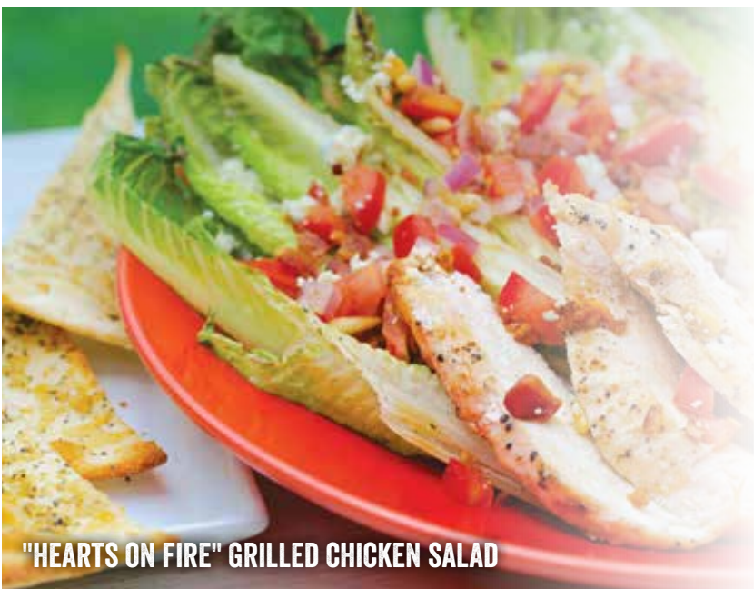
"HEARTS ON FIRE" GRILLED CHICKEN SALAD

Grilled hearts of romaine topped with a marinated chicken breast, balsamic drizzle, bleu cheese crumbles, toasted pine nuts, and crispy applewood smoked bacon. Comes with a housemade herbed flatbread. 15.99