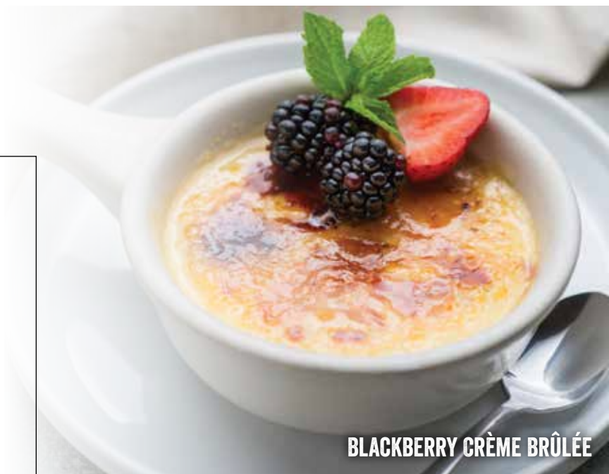
BLACKBERRY CRÈME BRÛLÉE