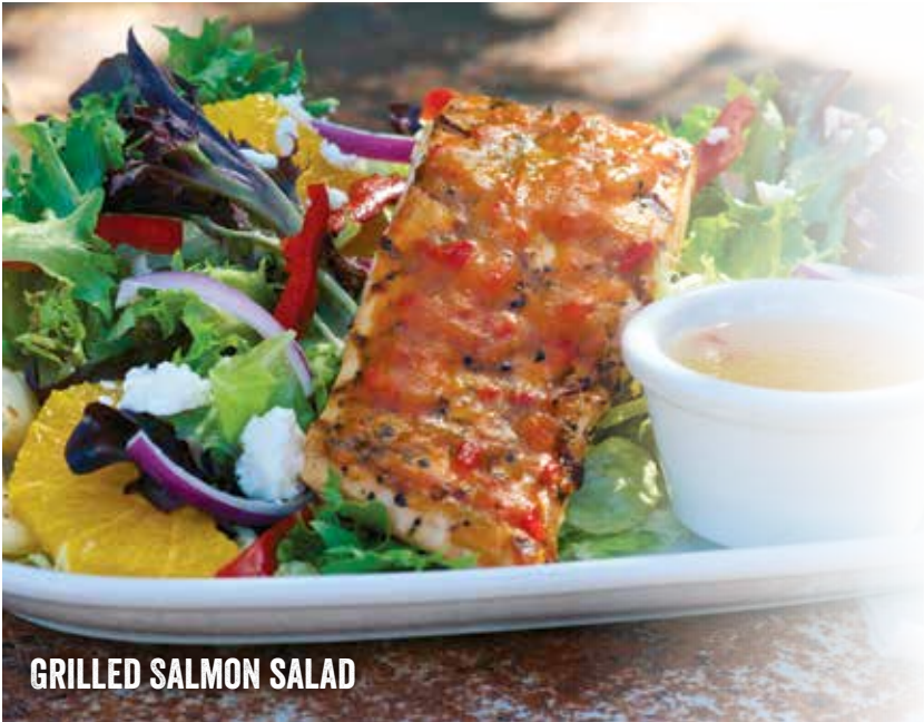
GRILLED SALMON SALAD