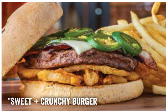
"SWEET + CRUNCHY BURGER