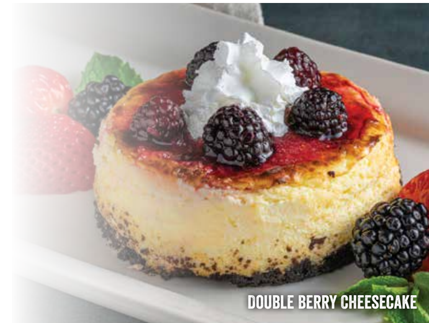
DOUBLE BERRY CHEESECAKE