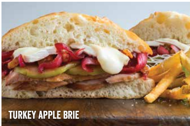
TURKEY APPLE BRIE