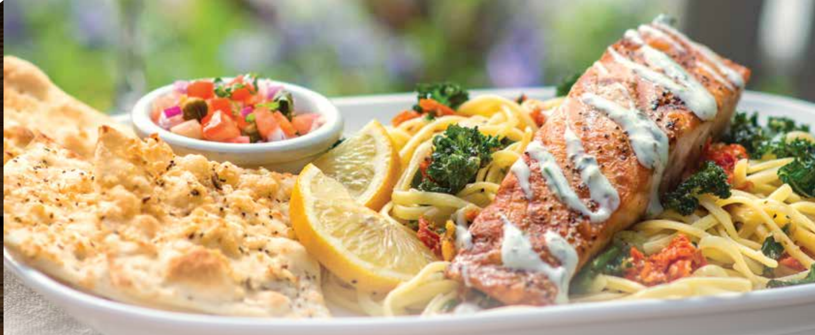
GRILLED SALMON PASTA