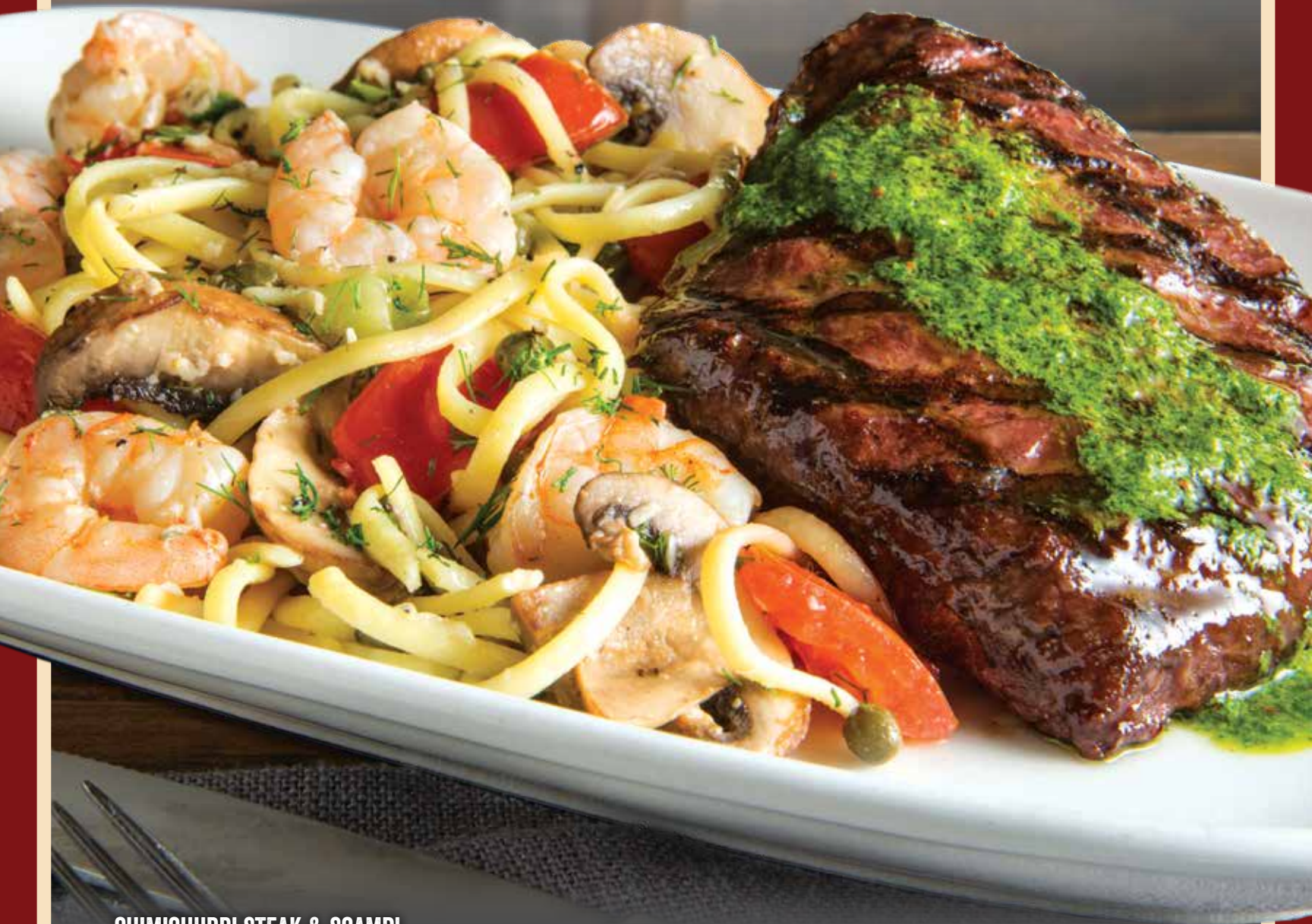
CHIMICHURRI STEAK & SCAMPI