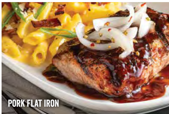
PORK FLAT IRON