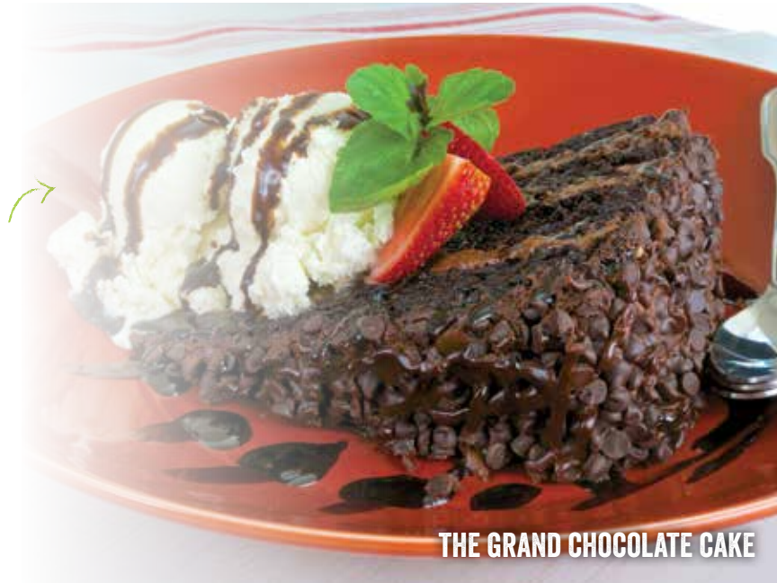
THE GRAND CHOCOLATE CAKE

Catering is available for all of your important events or special occasions. • Please ask for one of our catering menus for further details. • There is a $1.00 charge for all split orders. • Gift Cards available in any amount. • Prices and ingredients subject to change. • We accept Visa, Mastercard, Discover, American Express and cash. • Parties of eight or more are subject to an 18% gratuity; we ask the same of parties wishing separate checks. • If you have not been provided with a Customer Comment Card, please ask for one. • Consuming raw or undercooked meat, seafood or egg products can increase your risk of food-borne illness. • Thank You!