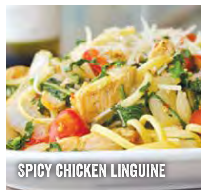
SPICY CHICKEN LINGUINE