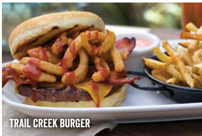
TRAIL CREEK BURGER

ALL SANDWICHES are served with SHOESTRING FRIES . Upgrade to GARLIC PARMESAN FRIES or SIDE SALAD for 1.29