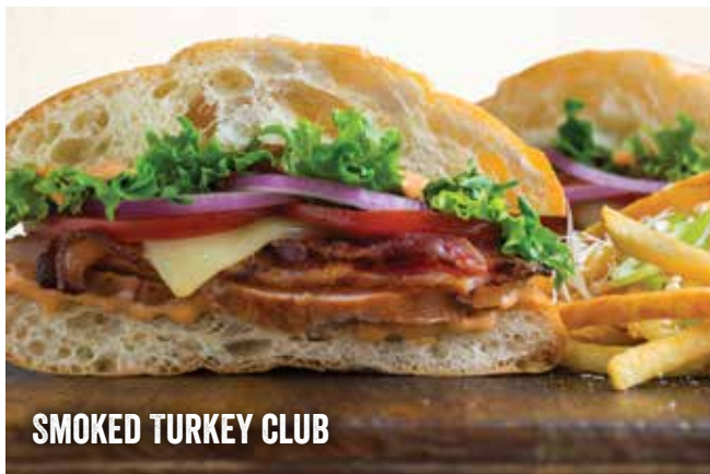
SMOKED TURKEY CLUB

Crispy Chicken Sandwiches feature TENDER CHICKEN BREAST fried to golden brown served with mayo on our TAVERN BUN .