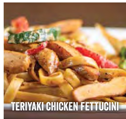
TERIYAKI CHICKEN FETTUCCINI