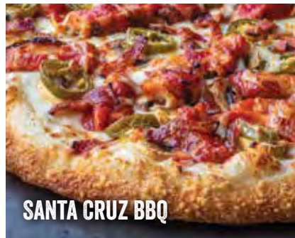
SANTA CRUZ BBQ

Mushrooms, onions, bell peppers, olives and tomatoes.