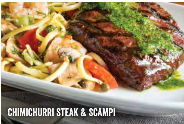
CHIMICHURRI STEAK & SCAMPI